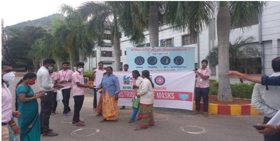
(NSS Volunteers Distributing Masks to Sweepers)