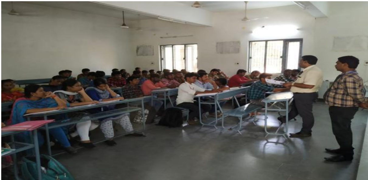
(HOD-MECH guiding the students HOD-CSE advising the students About Covid 19 SafetyMeasuresabout Covid 19 Protocols)